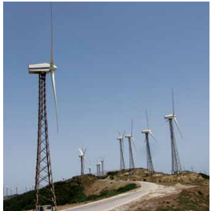
Tetouan Wind Farm, Morocco

By 2020, Portugal intends to be generating 60% of its electricity from renewable resources, in order to satisfy 31% of its final energy consumption. Grid integration will be a critical element for developing wind power. Interconnecting with the larger Spanish electricity market and the large hydropower system 168 enabled to integrate large amount of wind energy to the grid. However the interconnection capacity with Spain is already insufficient, since the wind regime is similar in both countries, and both countries have an overcapacity of gas and coal generation. Smart grids are now being promoted and deployed throughout Portugal as part of the National Energy Strategy. Their introduction is being combined with more efficient management of the existing networks.