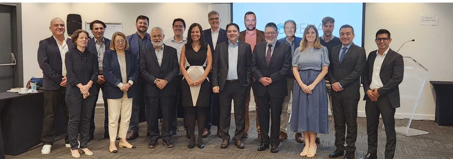
Participants in the morning sessions of the IRENA Sustainable Bioenergy Pathways in Latin America workshop, São Paulo, 17 March 2023.

More advanced and promising technologies are maturing. These include ethanol from cellulosic waste (second-generation ethanol), biomethane from biogas from various biomasses, and aviation biofuels, but their wide adoption is still incipient.